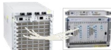
Figure 1: Arista with traditional WDM system

Today extending Ethernet networks over a Wavelength Division Multiplexing (WDM) connection is the data center managers' technology-of-choice for (Data Center Interconnect) DCI network architectures. Ethernet is preferred due to its familiarity and interoperability with the data center LAN, while WDM optimizes fiber utilization and provides low latency and distance advantages. Dense Wavelength Division Multiplexing (DWDM) has traditionally been associated as a technology used by long haul "active" DWDM platforms. However, with the advent of pluggable DWDM SFP+ transceivers which can be deployed directly into the Ethernet switch, users can now connect up to a maximum of 80 channels over a single pair of fibers with a maximum distance of 80 km without the need for complicated, bulky and expensive separate DWDM chassis systems.